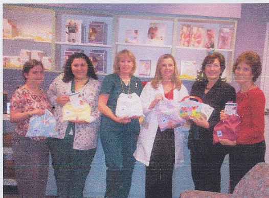
Book donation at St. Jude's Baby Wellness Center in December.