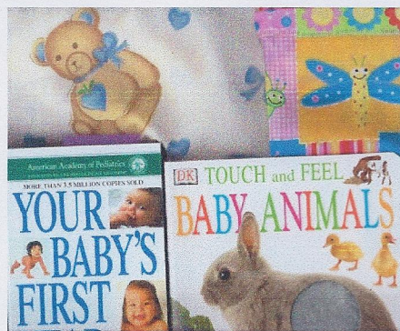
Items included in book bags given to new moms as part of Rotary Literacy project.